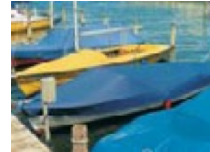
Roll Size: 86.5" x 32.81yds