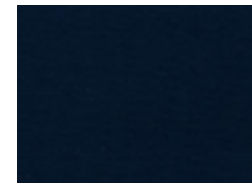
4217-540 Navy (Shown)