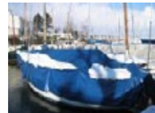
Roll Size: 86.5" x 32.81yds

Colors: Snow-White, White, Tan, Ivory, Black, Blue, Navy/Gray & Gray Special-Order Only Colors: Silver