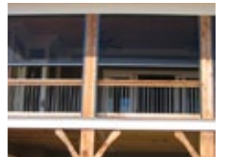
Roll Size: 61" x 60yds

NEED MORE INFO? - NOT A PROBLEM! Call today for more specifications on any of our Product Lines or visit www.recasensusa.com