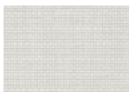
R-5000 Solid White (Shown)