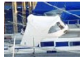
Roll Size: 84.5" x 32.81yds

Colors: White, Tan, Ivory Blue, Navy & Gray