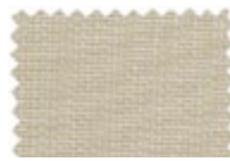
R-7121 Wheat (Shown)