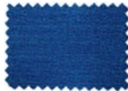
RW-172 Blue (Shown)