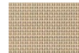
TSP-9002 Beige (Shown)

Colors: Beige, White, Gray, Alabaster, Black & Navy