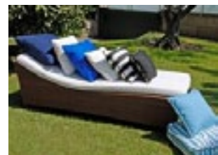
Roll Size: 54" x 65yds

Colors: Black, Tan, Moonrock, Gray, Blue, Navy Blue, Atlantic Blue, Green Tweed, Blue Tweed & Red Tweed