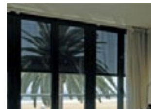
Roll Size: 118" x 27yds

Patterns: Repeat 2" (Two Patterns), Repeat 1" (Two Patterns) & Repeat 2.5" (Two Patterns)