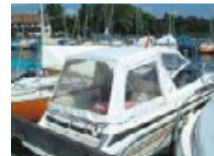
Roll Size: 86.5" x 32.81yds

Colors: Snow-White, White, Tan, Ivory, Black, Blue, Navy & Gray Special-Order Only Colors: Ocean Green & Silver