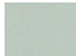
4233-706 Gray (Shown)