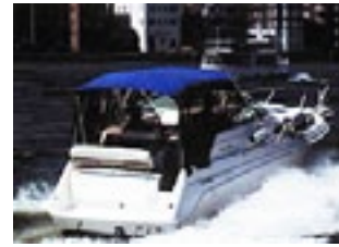
Roll Size: 60" x 65yds